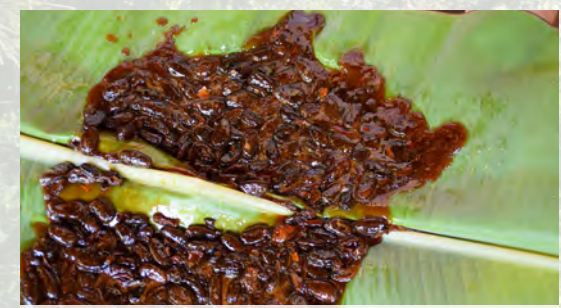
"Cacao garapinado" is one of the recipes used in the communities.

Spread onto a board or plate and let it cool.