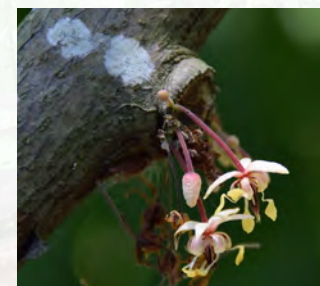
On the cocoa trees in agroforesty systems one finds not only cocoa fruits, but often different animal species. Right: The flowers of the cocoa-tree grow directly on the trunk.

In fact, the opposite is true, as demonstrated by farmer Macario Chub Xuc from Sierra de las Minas. There qualified staff were able to provide evidence of an increase in yields, after the trees in the area had been managed accordingly.