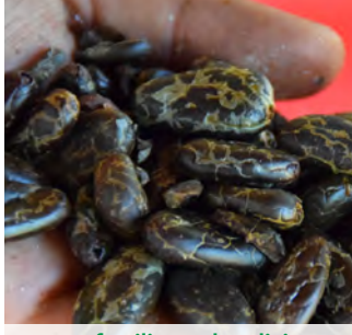
In the Sierras de las Minas biosphere reserve families make a living from growing cacao and beekeeping.

In eastern Guatemala lies the Sierra de las Minas mountain range, where biodiverse cloud forests grow at heights of up to 3010 m. In addition to providing the habitat for over 885 bird, reptile, amphibious and mammal species, the mountains also are the largest habitat worldwide for the rare resplendent quetzal, the national bird of Guatemala. On top of that, more than 60 rivers originate here securing the water supply to the region.