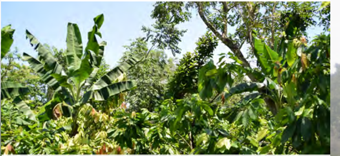
An agroforestry system after 5 years: several varieties of cacao growing beneath larger shade trees.

693 families from more than 30 communities are involved in this stage of the project and support the activities by producing honey, gathering Ramón and expanding and improving the agroforestry systems.