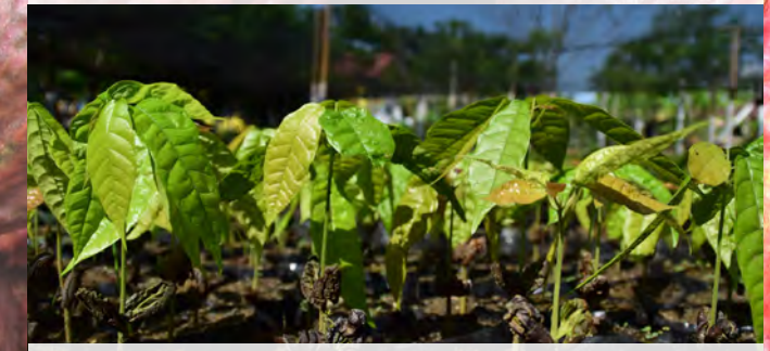
This is how it all starts: Cacao saplings in a tree nursery (El Estor, Bocas del Polochic).

As part of the project, two fermenting and drying facilities are currently being built, from which the local team expects a resulting value increase for the product. Because of their strategic location and their production potential, the people in charge picked one community in Sierra de las Minas and one in Bocas del Polochic as construction locations for these facilities. The surrounding communities will benefit from these measures as well, since all producers will have access to the facilities.