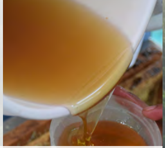
In the region of Bocas del Polochic, people support themselves by growing cacao and keeping bees in agroforestry systems.

The river Polochic is the lifeline of the Bocas de Polochic wetlands, which starts at the foot of the Sierra de las Minas range and merge into Lake Izabal. Amongst others the rare manatees can be found here. Due to the international importance as a waterfowl habitat, the region was internationally recognized as a UNESCO RAMSAR wetland site. In this region too, local people grow cacao and produce honey.